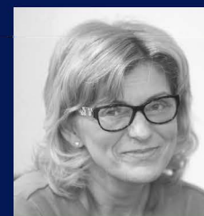
SOLDO FAMILY OUR HOSTS